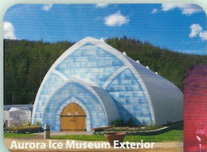
Aurora Ice Museum Exterior

440 acres of beautiful wilderness! 60 scenic miles from Fairbanks.