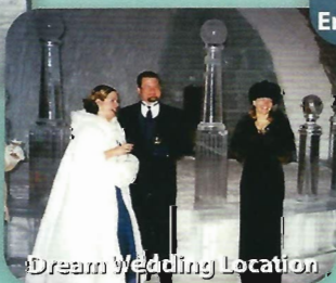
Dream Wedding Location