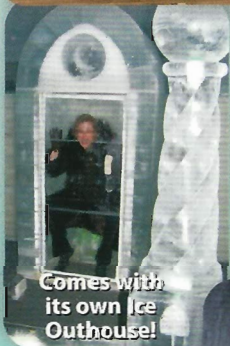
Comes with its own Ice Outhouse!

It may be 80° outside, but it's a cool 20° inside year-round!