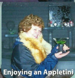
Enjoying an Appletini

It may be 80° outside, but it's a cool 20° inside year-round!